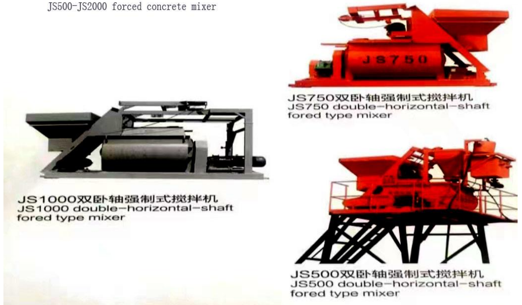
JS1000双卧轴强制式搅拌机 JS1000 double-horizontal-shaft forced type mixer