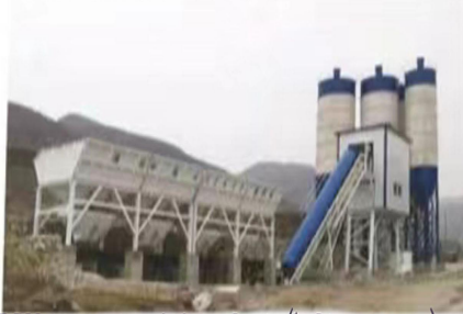
HLS60 concrete mixing plant (belt conveyor)