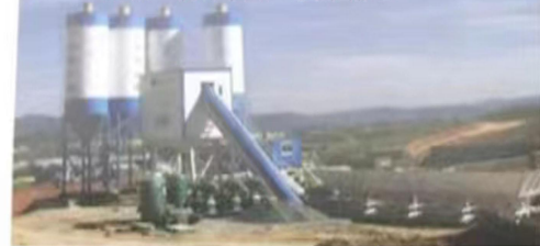
HLS180 concrete mixing plant (belt conveyor)