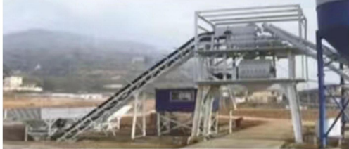
HLS120 concrete mixing plant (belt conveyor)