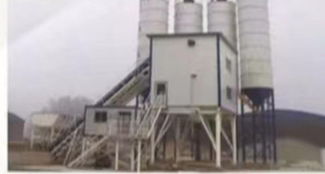
HLS90 concrete mixing plant (belt conveyor)