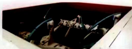
JS3000主机的搅拌系统 Mixing system of JS3000 mixer