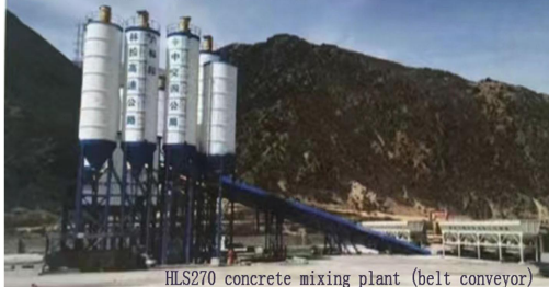
HLS270 concrete mixing plant (belt conveyor)