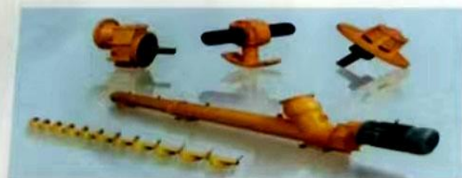
螺旋输送机及配件 Screw conveyor and parts