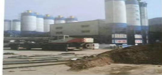
HLS300 concrete mixing plant (belt conveyor)

皮带输送式混凝土搅拌楼站, 采用皮带输送上料; 整套设备由骨料、粉料存储系统、骨料中储仓、计量系统、上料输送系统, 搅拌系统, 集成全自动电子控制系统等组成。搅拌机采用自主研发或 SICOMA JS1000-JS5000 型强制式搅拌机。